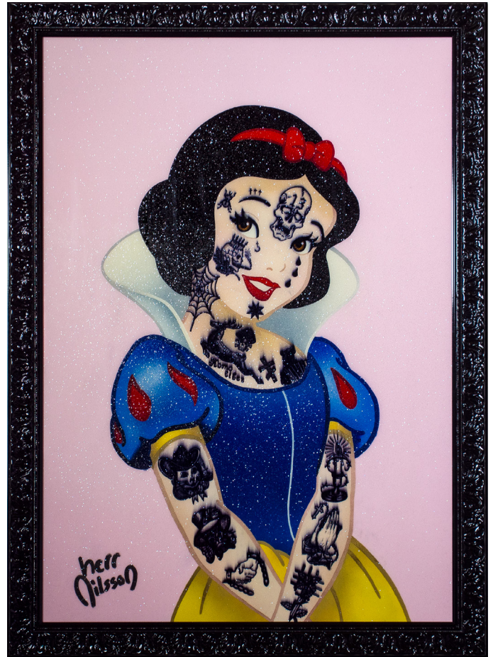
Snow White with russian prison tattoos.