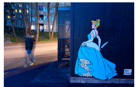
Street art installations in Stockholm of the Dark Princesses.