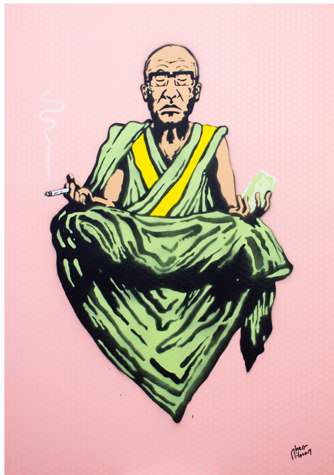
The Nirvana series.